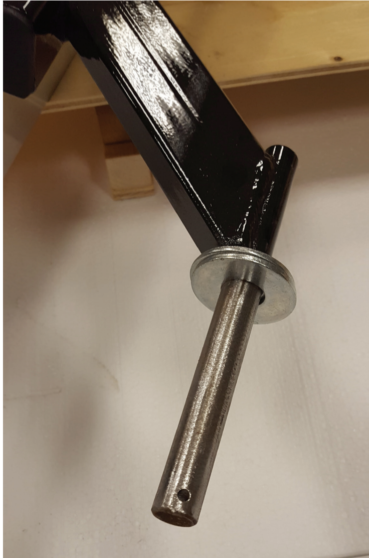
Image of Clip and Washers Removed