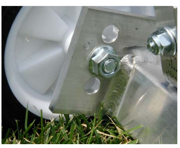
Three height adjustable sweeper settings