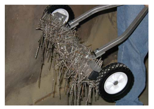
Powerful magnets never need recharging