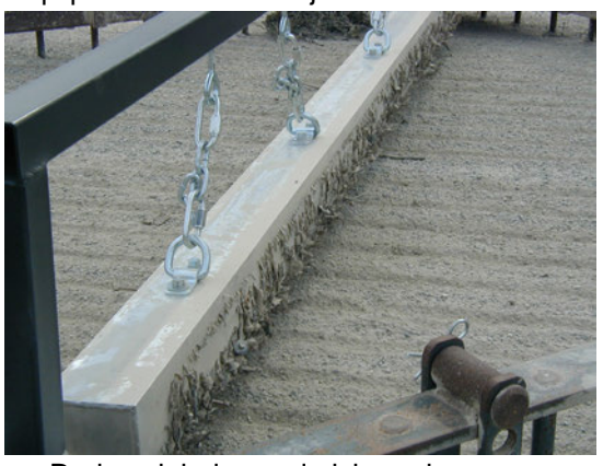
Reduce injuries and pick up dangerous metal debris from horse tracks