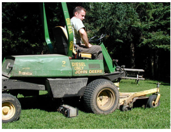
Extend the working power of your current equipment and do two jobs at the same time