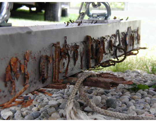
Reduce flat tires and down time caused by harmful and dangerous metal debris